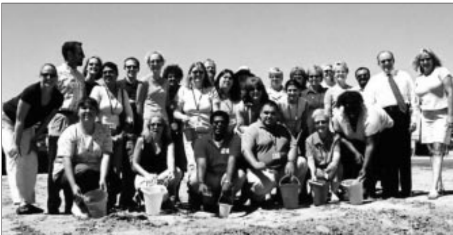
North Bakersfield team attends a groundbreaking of their new office at 2001 North Chester Avenue

Call Guild House at 325-5478 to register for your favorite class or for more information about these classes and other special events.